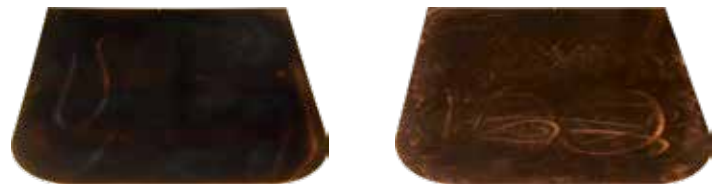
Artisan Black (side 1) ← or → Artisan Bronze (side 2)

Steel hearth pad color options include Artisan Black / Artisan Bronze (depending on which side is displayed) or Textured Black. Artisan colors are created by hand and with heat. No two hearth pads will ever be the same.